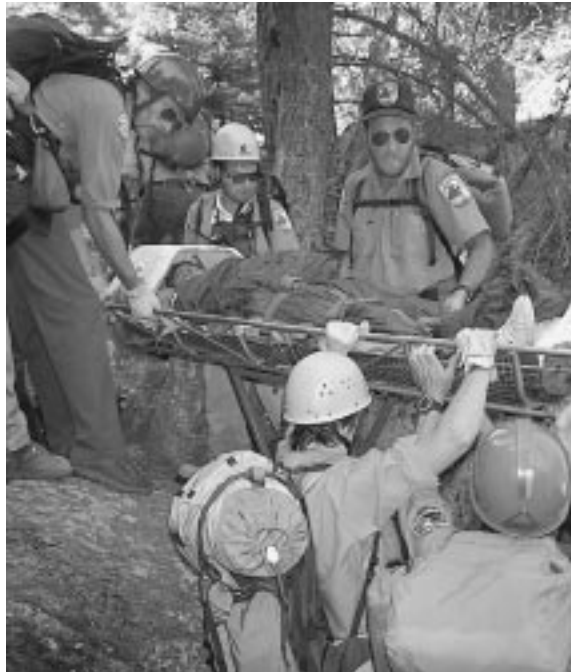
©1997 Larimer County Search and Rescue, Inc. Photographs ©1997 William A. Cotton